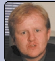
Paul Clements-Hunt Head United Nations Environmental Programme (UNEP) Finance Initiative, Switzerland